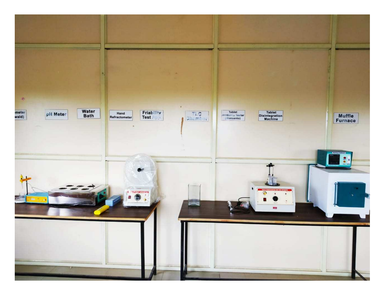
Quality Control Lab